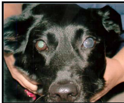
Intrascleral prosthesis on the right side

San Diego 10435 Sorrento Valley Rd San Diego CA 92121 858.875.7500